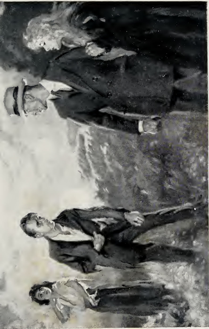
As he stumbled towards them, Santa uttered a nervous cry and turned.